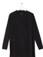
ULTRAFINE MERINO STRAIGHT LONG CARDIGAN EEIUO-K3500, $318 BLACK