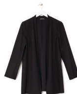
LIGHTWEIGHT WASHABLE STRETCH CREPE LONG JACKET EETL-J5294, $288 BLACK