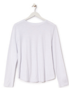
SLUBBY ORGANIC COTTON JERSEY ROUND NECK LONG- SLEEVE TOP E2SOJ-T5026, $78 WHITE, BLACK