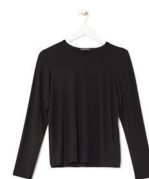
FINE TENCEL JERSEY CREW NECK TOP EEFTJ-T0011, $98 WHITE, BLACK