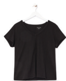
SLUBBY ORGANIC COTTON JERSEY V-NECK SHORT-SLEEVE TEE E2SOJ-T5330, $68 WHITE, BLACK