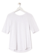
SLUBBY ORGANIC COTTON JERSEY ROUND NECK ELBOW- SLEEVE TOP E2SOJ-T4368, $68 WHITE, BLACK