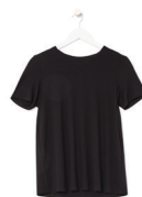
FINE TENCEL JERSEY ROUND NECK CAP- SLEEVE TEE EEFTJ-T4192, $88 WHITE, BLACK