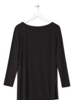
FINE TENCEL JERSEY BATEAU NECK TUNIC EEFTJ-T5344, $138 BLACK